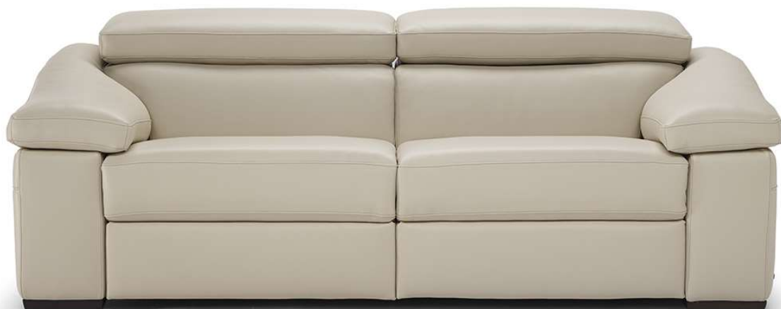
■ Vers. D46