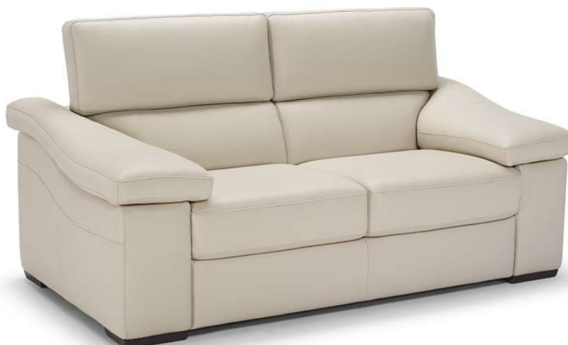
■ Vers. 005