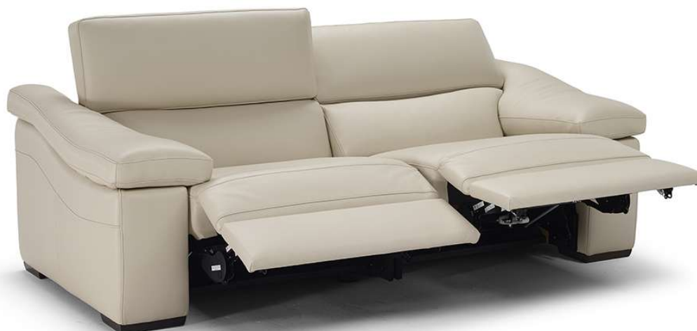
■ Vers. D46