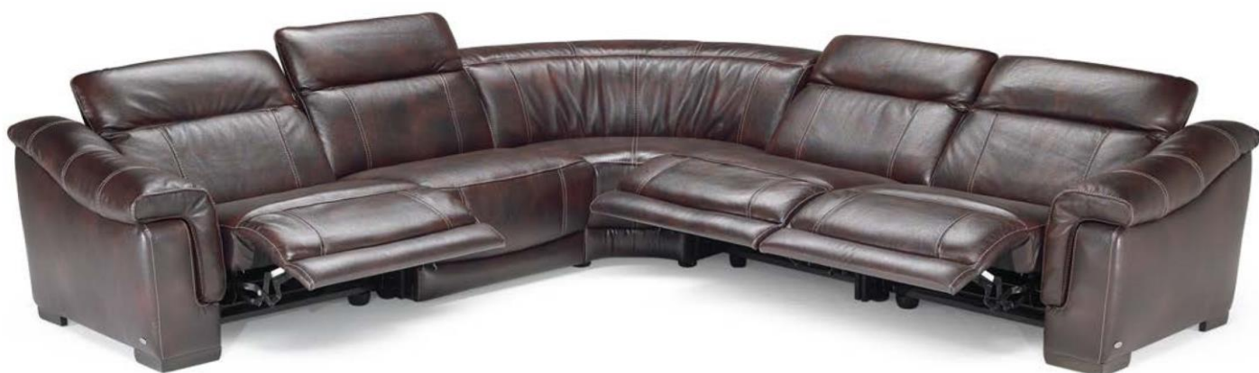
vers. 360 + 328 + 029 + 328 + 362