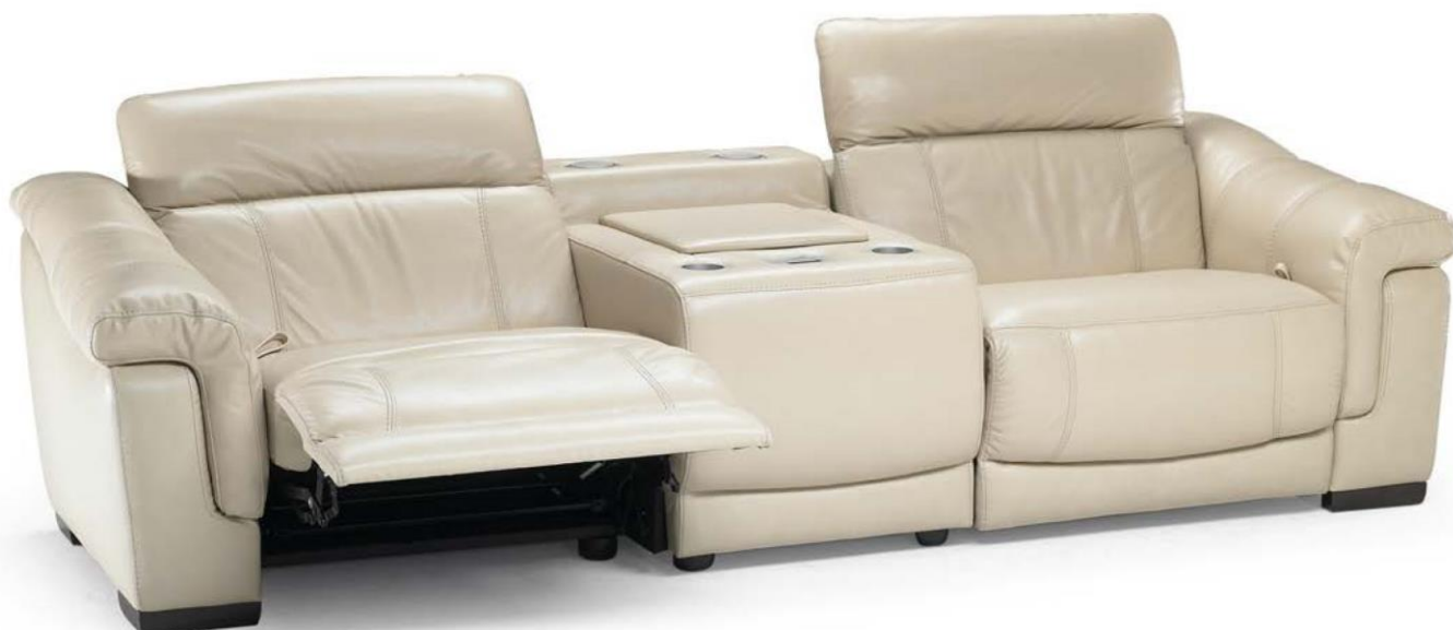
vers. 360 + 307 + 362